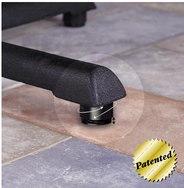
Patented spring-and-ramp mechanism uses table weight to compress or expand on uneven floors.

Superlevel's patented spring-and-ramp mechanism creates an automatic self-adjusting action that maintains a wobble-free table even when the table is moved.